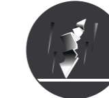
Superficie extra resistente agli urti