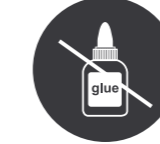
Installazione senza colla