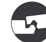
Sistema di chiusura angolo stretto