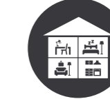
Perfetto per tutti i tipi di ambiente